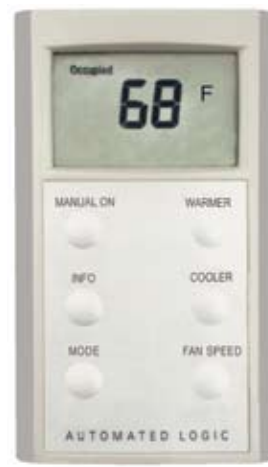
RS Pro F

Automated Logic's line of intelligent sensors includes the RS Standard, RS Plus, RS Pro and RS Pro F and is designed for use with the ZN, SE, ME line controllers and Room Controller. The RS Plus offers a local set point adjustment and override to an occupied mode and LED indication of current status. The RS Pro has a large LCD display and easy-to-use occupant controls. The RS Pro F includes additional functions ideal for fan coil units operating with multiple fan speeds. All sensors provide precision measurement and communication capabilities in attractive low profile enclosures. A hidden communications jack provides local access to the HV-ac control system for commissioning and maintenance.